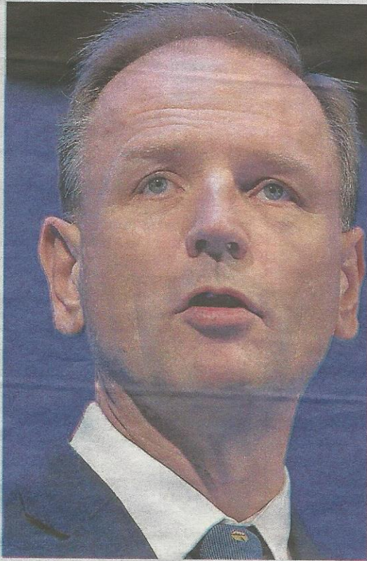
■ Simon Stevens, NHS England chief executive

NHS England chief: We could not ignore pressures on surgeries